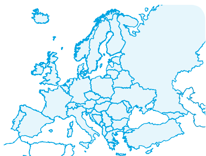
FOREST EUROPE Signatory Countries

Forest management is also focused in the conservation of genetic resources since genetic diversity ensures that forest trees can survive, adapt and evolve under changing environmental conditions.